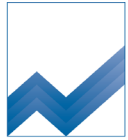
Chart 1: Household Financial Conditions Index